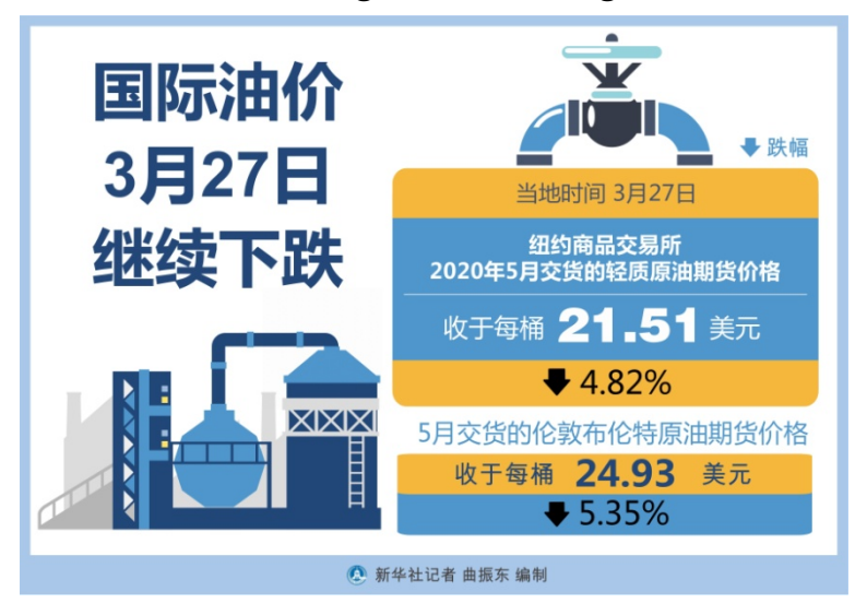
International oil prices continue to fall.

The impact of COVID-19 on China's cooperation with Eurasian countries should not be underestimated and the practical cooperation between the two sides is facing severe challenges.