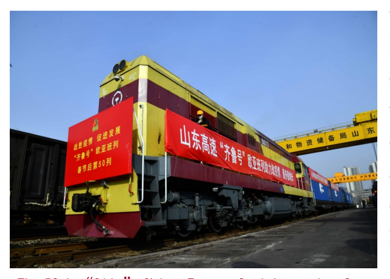
The 50th "Qilu" China-Europe freight train after the Spring Festival started its journey on February 21.

Second, although the epidemic will affect China's cooperation projects in Eurasia to some extent, it will not shake the solid foundation of cooperation between two sides. China is irreplaceable in