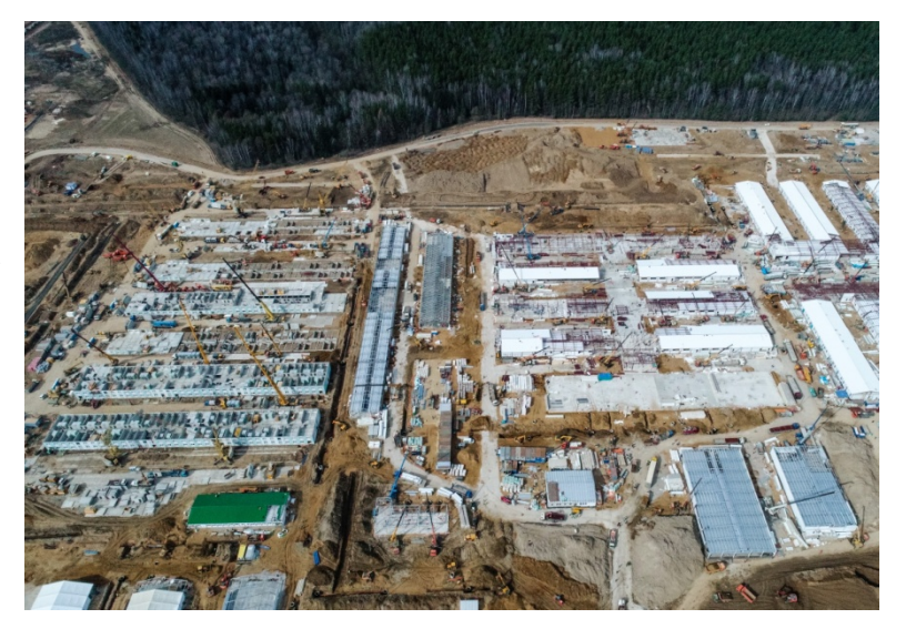
The Moscow makeshift hospitals under construction.

At the same time, the Russian government has also strengthened domestic control. One measure is to avoid the gathering of crowds. On March 5, the government announced the cancellation of the St. Petersburg International Economic