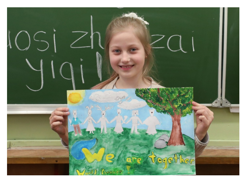
A painting by a Belarusian elementary school student expressing the beautiful wish of "joining hands to fight the epidemic"

emerging markets and developing countries represented by China and others is driving global development economic epicenter transfer from Europe and Atlantic Ocean to Asia and Pacific Ocean. This trend requires а re-adjustment of global power structure and interest distribution pattern, and changes the