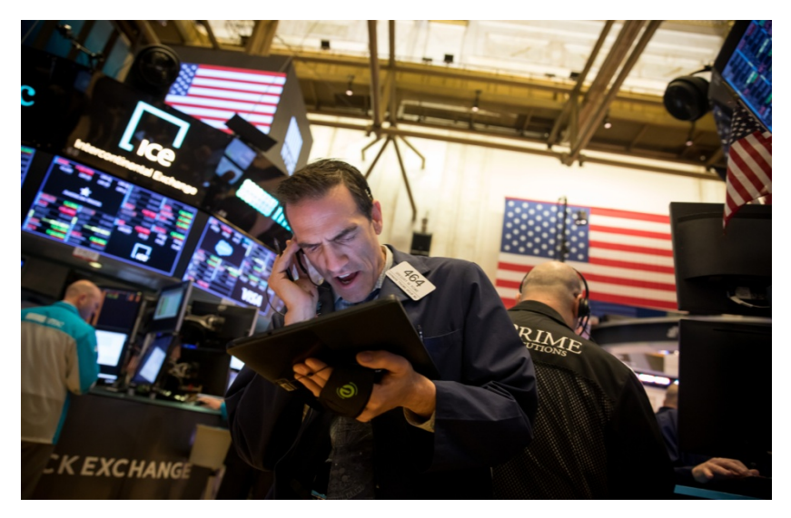
In New York, steep falls in the afternoon triggered another key circuit breaker on March 18.

China's anti-virus progress is positive news financial for markets which to a certain degree helps to restore domestic confidence. investors' However, the COVID-19 pandemic is currently spreading across the globe and affecting more and more people. Its