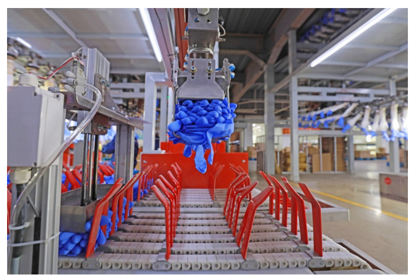
All-out efforts to ensure the supply of medical protective gloves in Luannan, Hebei province.

Since the outbreak of the Coronavirus, China has consistently put people's safety and health first and adopted the most comprehensive, strict and thorough measures to resolutely curb the virus from spreading. With great self-sacrifice and painstaking efforts, China steadily fulfills its duty and buys precious time for the global combat against COVID-19. Immediately after the outbreak, the Chinese government regarded epidemic prevention and control as the country's current top priority. China is aligned from the top to the bottom and working in solidarity to take precise and effective measures.