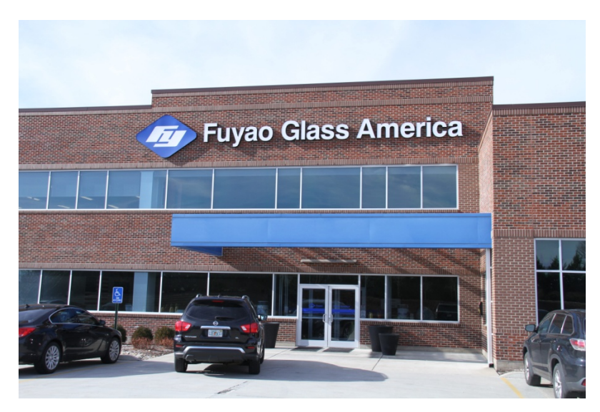
A Fuyao Glass factory at Dayton, Ohio, USA.

Western countries including the United Kingdom, US, Germany, France and Denmark, were the leader of economic globalization, since they mastered advanced technologies and realized modernization at the earliest time. With these advantages, they had enormously benefited from the process. Particularly, economic globalization waves driven by the 2<sup>nd</sup> and 3<sup>rd</sup> Technological and Industrial Revolutions helped US realize momentous leaps to an industrialized and an advanced industrialized nation. US has hence topped global GDP ranking since at least 1920s. It is well known that the initial stage of economic globalization is also a history of colonial expansion full of bullies and extortions. Even nowadays, development imbalance among regions and countries, the wealth gap, governance deficit and other issues emerged during economic globalization process are still extremely terrible and alarming. However, there is no denying that economic globalization has indeed boosted unprecedented wealth gains and civilization progress in human society. According to IMF, global GDP totaled from 11.15 trillion to about 84.74 trillion in current US dollars from 1980 to 2018. During the same