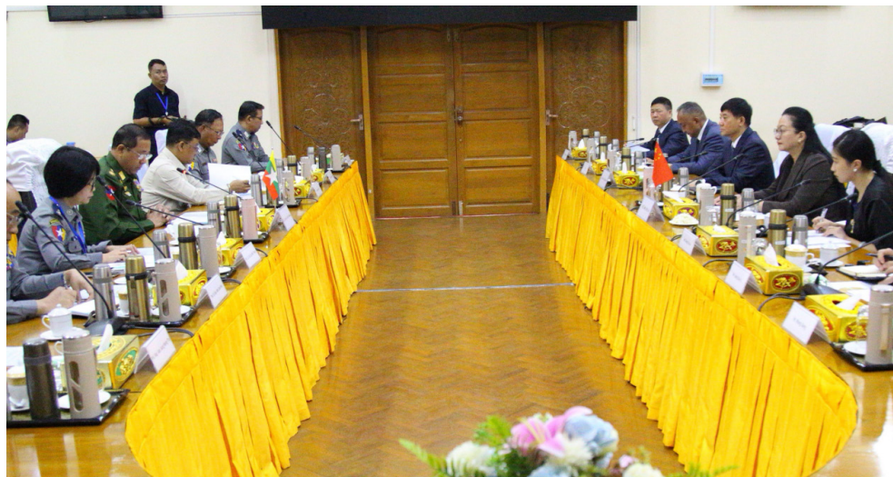
China and Myanmar exchanged views on jointly combating online gambling and telecom fraud crimes on February 14, 2025