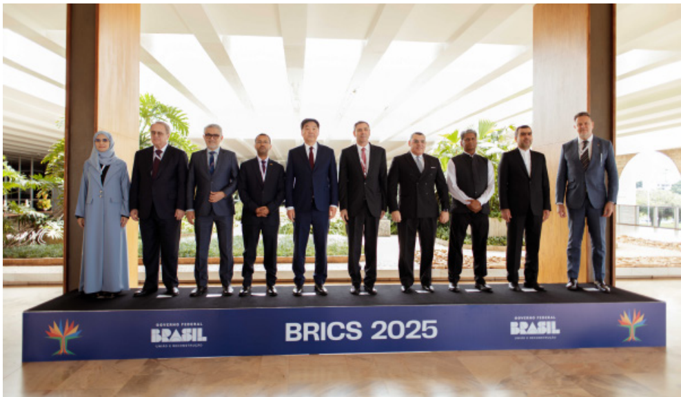
BRICS Deputy Foreign Ministers/Special Envoys Consultation on Middle East was held in Brasília on March 28, 2025

the Ukraine crisis, Syria, the Iranian nuclear issue, Africa, Afghanistan, Haiti, as well as counter-terrorism, cybersecurity, energy and food security, artificial intelligence, the fight against transnational crime and corruption, and the revitalization of the arms control, disarmament, and non-proliferation regime, BRICS countries have engaged in sustained dialogue and coordinated their stances with remarkable synergy. In terms of mediation and conciliation, BRICS countries have always been at the forefront of the world. From promoting the historic reconciliation between Saudi Arabia and Iran, facilitating the prisoner exchange between Russia and Ukraine to initiating the Group of Friends for Peace on the Ukraine crisis, BRICS countries have accumulated unique experiences and advantages. ① Indeed, the involvement of BRICS countries has been instrumental in effectively addressing numerous pressing and significant global challenges.