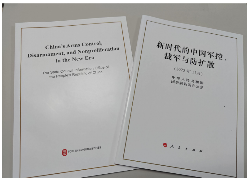
The State Council Information Office releases the white paper titled China's Arms Control, Disarmament, and Nonproliferation in the New Era

security, aiming to reinvigorate multilateral arms control and consolidate the foundation for peaceful development. ① China also places great emphasis on the humanitarian concerns stemming from landmines. It has initiated the “Lancang-Mekong Cooperation in Mine Action” project with Cambodia, and collaborated with Ethiopia, Somalia, and other countries as well as the African Union to implement the second phase of projects under the “Action For A Mine-free Africa” framework, thereby continuously strengthening international assistance and cooperation on mine action.