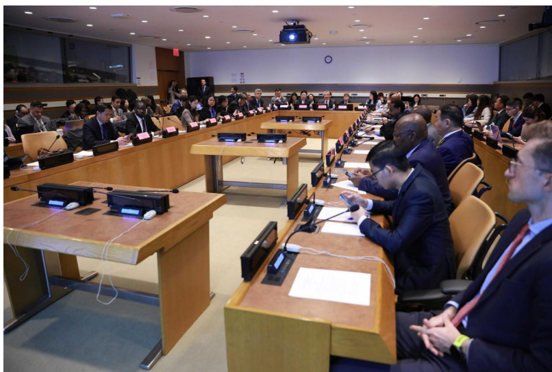
A thematic meeting of the Group of Friends for International Cooperation on AI Capacity-building was successfully held at the United Nations on May 6, 2025

Group on the Prevention of an Arms Race in Outer Space (PAROS), championing the ethos of the Global Security Initiative and encouraging parties to contribute substantive insights toward the formulation of a legally binding instrument on arms control in outer space. In December, China and Russia co-sponsored resolutions at the United Nations General Assembly on “No First Placement of Weapons in Outer Space” and “Further Practical Measures for the Prevention of an Arms Race in Outer Space,” both of which were adopted with overwhelming support. For nine consecutive years, China’s vision of a community with a shared future for humanity in the exploration and peaceful use of outer space was included in relevant UN General Assembly resolutions.