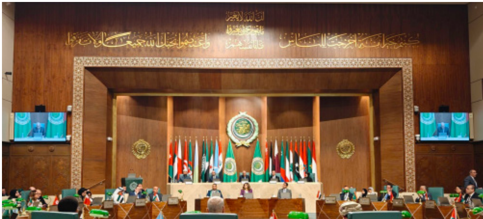
The League of Arab States hosted the event of the “International Day of Solidarity with the Palestinian People” in Egypt on November 30, 2025

On October 9, Israel and Hamas forged a first-phase ceasefire and prisoner swap agreement, momentarily pausing the two-year-long spiral of violence in the Palestine-Israel conflict. Nevertheless, mutual recriminations persist between the two sides, with intermittent skirmishes flaring up in proximity to the Israeli withdrawal line. Since the ceasefire agreement was reached, the local death toll has risen by 354, with 906 injuries reported. ① The outlook for a second-phase ceasefire agreement is now shrouded in uncertainty. Pivotal issues, such as the disarmament of Hamas, Israel’s subsequent troop withdrawal, the governance framework for Gaza’s reconstruction, and the mobilization of reconstruction funds, still hang in the balance. Israeli Prime Minister Netanyahu asserted on November 10 that this round of conflict “has not yet drawn to a close.” ② The biased mediation of the United States has also raised the likelihood of renewed conflict, as the “20-Point Plan” sidesteps the “two-state solution” and is devoid of equity.