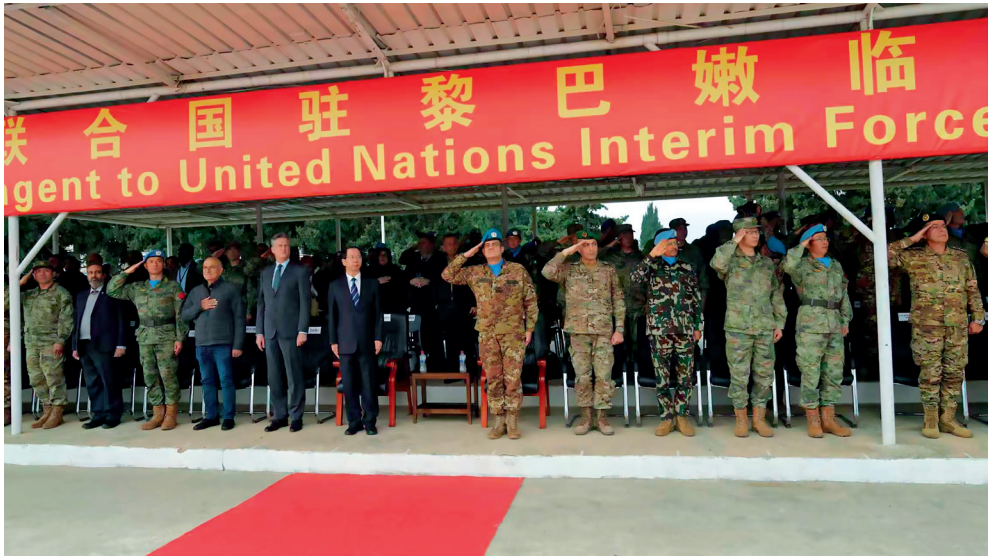
From 11 to 18 December, 2025, Chinese peacekeeping contingent to UNIFIL completed its 23rd rotation

peacekeeping operations and the UN Headquarters, making significant contributions to restoring peace and stability in mission areas, facilitating judicial reconstruction in host countries, and protecting the safety of local populations. ① Additionally, 2025 marked the 10th anniversary of the establishment of the China-UN Peace and Development Fund. Since 2015, China has initiated over 200 practical cooperation projects across more than 100 countries, aiding developing countries in enhancing their capacities for peace, security, and sustainable development. ② The Fund has evolved into a crucial platform for deepening cooperation between China and the United Nations and was extended for another five years upon its expiration in 2025.