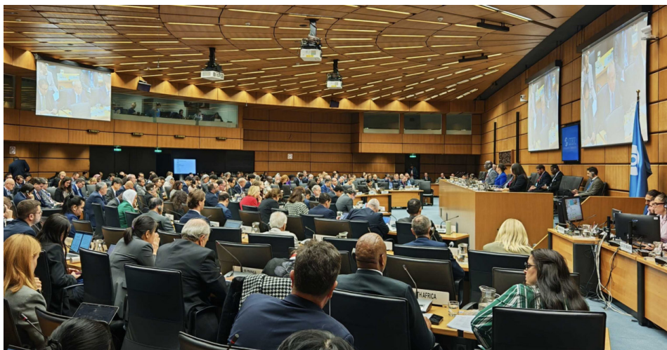
The 65th Session of the Preparatory Commission for the Comprehensive Nuclear-Test-Ban Treaty Organization was held at the United Nations Headquarters in Vienna on November 10, 2025

Furthermore, Trump has, on multiple occasions, declared his intention to resume nuclear weapons testing. Russia has formally announced its discontinuation of compliance with the Intermediate-Range Nuclear Forces Treaty (INF Treaty). The New Strategic Arms Reduction Treaty (New START Treaty), the only bilateral nuclear arms control pact remaining between the United States and Russia, is slated to expire in 2026, with neither party having yet embarked upon negotiations concerning subsequent arrangements for the treaty. The domain of conventional arms control is also mired in crisis, as evidenced by the announcements from Ukraine, Lithuania, Latvia, Estonia, Finland, and other countries of their withdrawal from the Convention on the Prohibition of the Use, Stockpiling, Production and Transfer of Anti-Personnel Mines and on their Destruction (Ottawa Convention), coupled with Lithuania's declaration of its withdrawal from the Convention on Cluster Munitions .